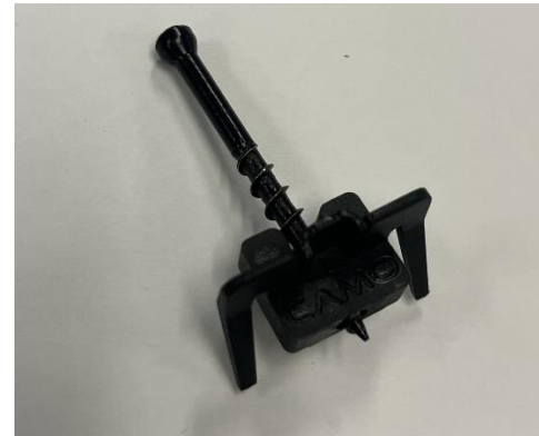
Figure 3. CAMO WedgeClip Hidden Fastening System.