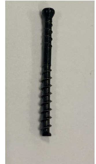
Figure 4. CAMO Edge Screw Hidden Fastening System.